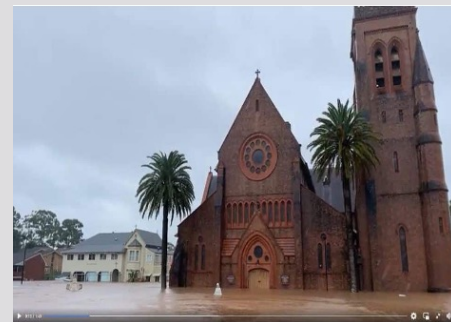
St Carthage's Cathedral, Lismore, inundated by floodwaters on 28 February, 2022.